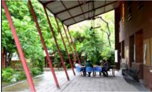
Collaborative innovative space

AHMEDABAD UNIVERSITY Center for Innovative Business Design